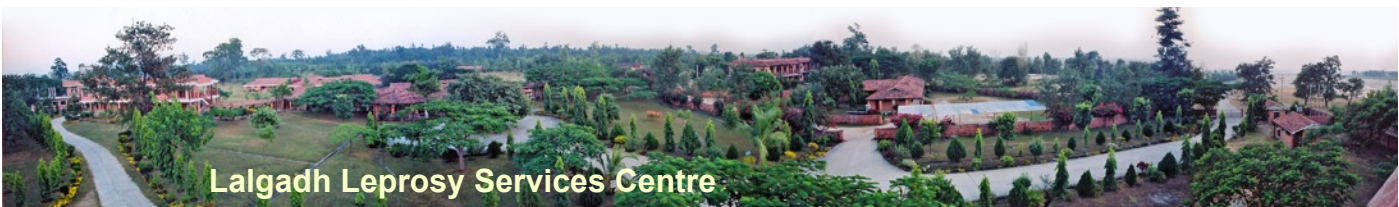
Lalgadh Leprosy Services Centre