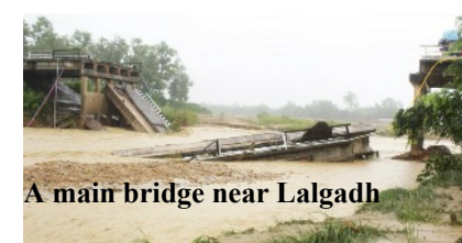
A main bridge near Lalagadh

As in 2017, Nepal is once again facing some very severe rain that has already caused bad flooding in Kathmandu and the Terai. In Kathmandu, the Kalanki area has been very affected with people needing rescue and some roads badly flooded. Much of the Terai area has also been flooded and parts of the East-West