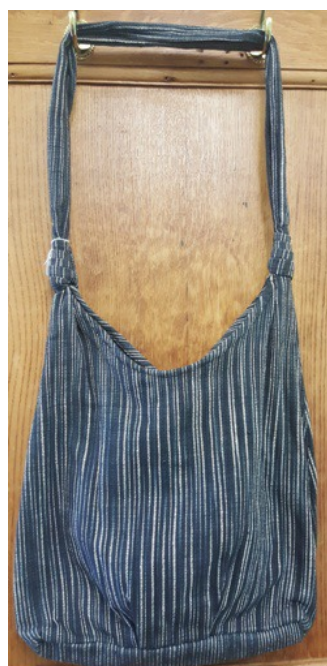
LQC002 - £7.50

Double shoulder strap 70 cms Length - 33 cms Width - 15 cms Height - 34 cms Fully lined with central zipped pocket, 1 open pocket, detachable purse & tie closure.