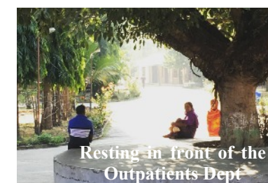
Resting in front of the Outpatients Dept

The first guided trip for NLT supporters is taking place this November to give some of our NLT friends from the UK a chance to visit Nepal with confidence, and see the work that NLT does with their own eyes. They will