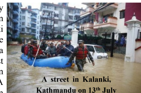
A street in Kalanki, Kathmandu on 13 th July

Highway have been under water. A number of bridges on this major road are under threat, and one near Lalagadh has already been demolished by floodwaters.