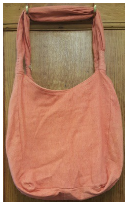
LQF001 - £10.00

Double shoulder strap 70 cms Length - 33 cms Width - 15 cms Height - 34 cms Fully lined with central zipped pocket, 1 open pocket, detachable purse & tie closure.