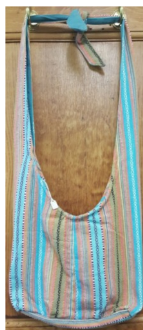
LQF001 - £6.50

Single shoulder strap 82 cms Length - 30 cms Width - 12 cms Height - 31 cms Fully lined with zipped pocket & outer zip closure.