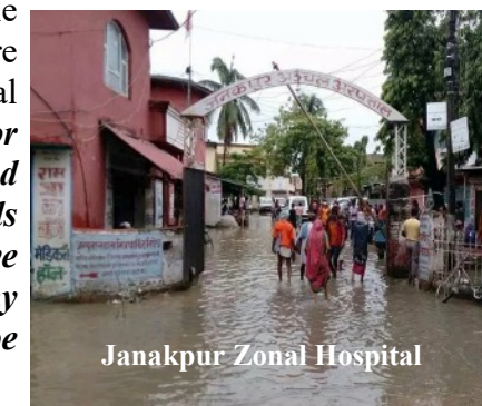
Janakpur Zonal Hospital

have died and at least 35 are missing. 28 districts in Nepal are affected. Please pray for the relief efforts needed amongst the thousands affected. We will do what we can in our area, and any help you can provide will be deeply appreciated.